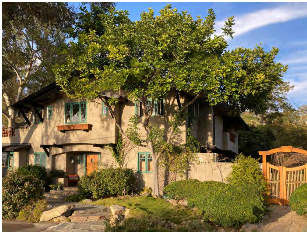
The beautiful trees, vines and wood gate in the garden of this lovely Laguna home are examples of features that would not be allowed by the Fire Department in much of the city if their landscape restrictions are passed by the City Council.

Vines, 4'+ shrubs or trees within 10' of a home