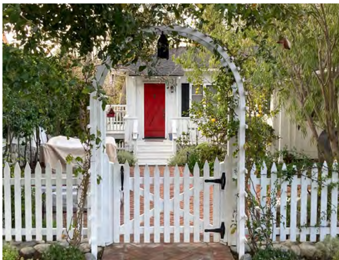
Wood picket fences and trellises will be on the forbidden list. What would Laguna be without gardens like these?