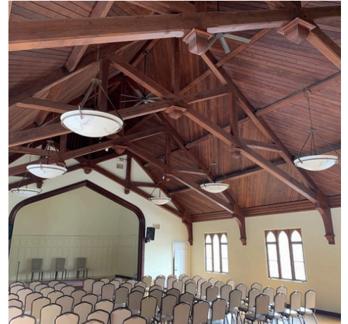
Bridge Hall/Aubrey St. Clair architect

Representatives of Village Laguna have met with representatives of the NCC to discuss the proposed project to demolish all the existing buildings on the property and instead build a 72-unit apartment structure with underground parking. This all to be accomplished with state and city housing grants and other financing arranged through the developer, Related California. The church will end up with a “spiritual center” within the new complex. A new state-authorized streamlined approval process dictated in SB-4, can facilitate this project without our normal reviews and California Environmental Quality Act process. The concerns and potential impacts are numerous and a new community organization named “Reasonable Housing for Laguna” has been formed to affect the preservation of “the character, scale and spirit of Laguna Beach” in this project.