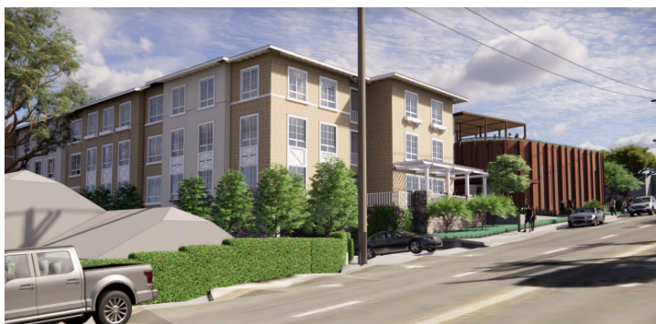
Proposed affordable housing project and new spiritual center as viewed from Glenneire and Cleo.