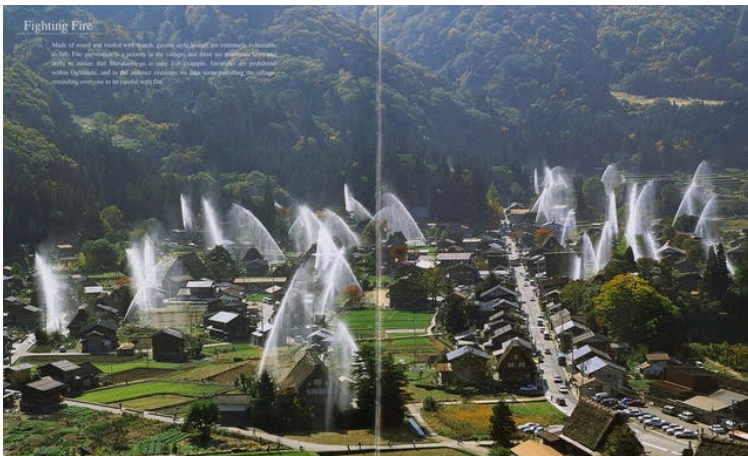
Water cannon fire protection system at Shirakawago, Japan

The terrible fires in Los Angeles spark so many emotions—sorrow, sympathy, fear, frustration, the desire to know what we can do to help, and how to prevent more such tragic and dangerous events. For those of us who lived through the 1993 Laguna Beach fire, it makes all those old feelings raw again. Predictably there will be more calls for removing more vegetation, both native and around structures. There are other approaches--protecting the buildings which are the most flammable. Is it really too expensive to install water systems at the urban periphery and within neighborhoods compared to the billions lost in these fires? We send partially treated wastewater out to the ocean every day from the Aliso Creek treatment plant. We have the ability to treat it to reclaimed standards, have a reclaimed water distribution and storage system to add to the water available to protect ourselves. Shirakawago, Japan decided they were going to protect their town from fire—see their sprinkler system in action! Here are two references: chaparralwisdom.org , https://californiachaparral.org/fire/protecting-your-home/