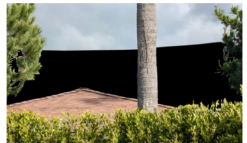
Projected view after construction of the two story ADU.