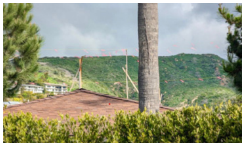
View to Crystal Cove State Park ridgeline at 1673 Louise St. with staking for ADU.

A 2-story ADU is proposed for 1673 Louise Street in north Laguna and the neighbors are making the case that it will block public views of a scenic ridgeline, open space that is part of Crystal Cove State Park and the Laguna Coast Wilderness Park. Neighbors are appealing city approval of the project. Stacy Simondi, who helped prepare the appeal, will be speaking at our meeting of June 9 to help us understand the rationale for the appeal. Similar projects could be proposed in neighborhoods throughout the city and the city should be supported in using every policy allowable to minimize impacts on the character of our community while providing the state-required housing.